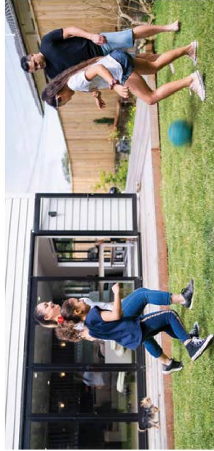
New Zealand Residential Property Sale and Purchase Agreement Guide

A sale and purchase agreement provides certainty to both the buyer and the seller about what will happen when.